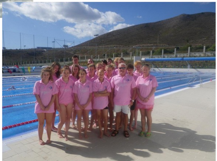
A swimmer's perspective